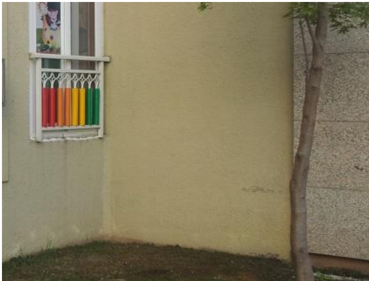
Compared to general paint