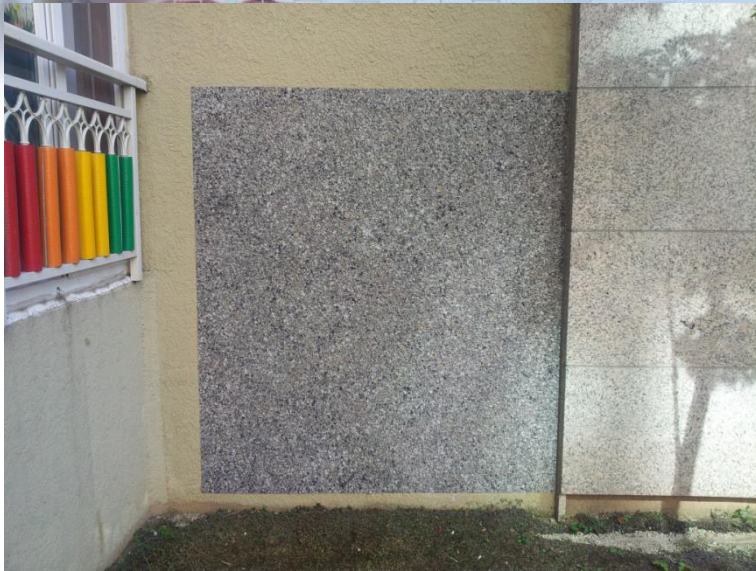
Finished looks (left) compared to marble (right)