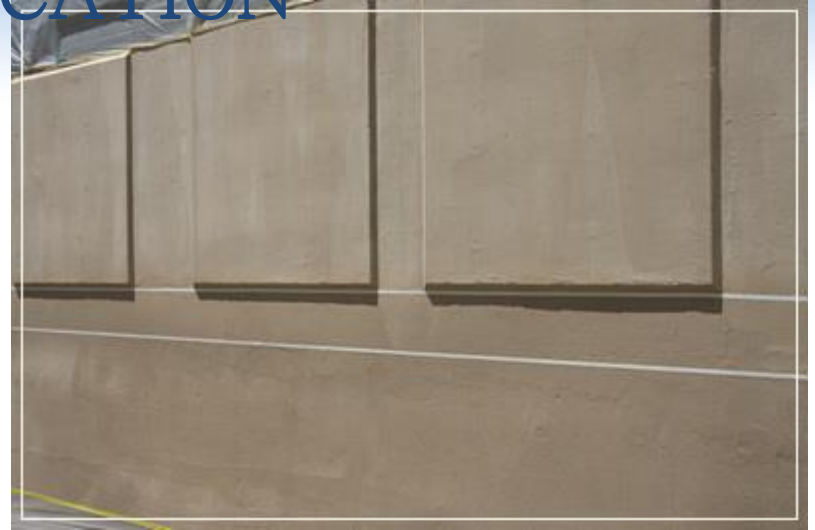
2. YEGREENA STONE EVER primer