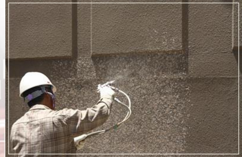
4. YEGREENA STONE EVER Intermediate coating/top coat