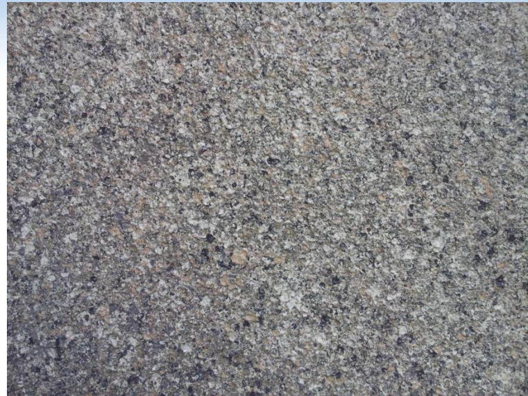
A Closed look