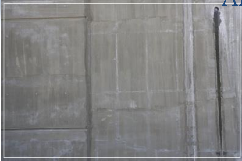
1. Substrate adjustment