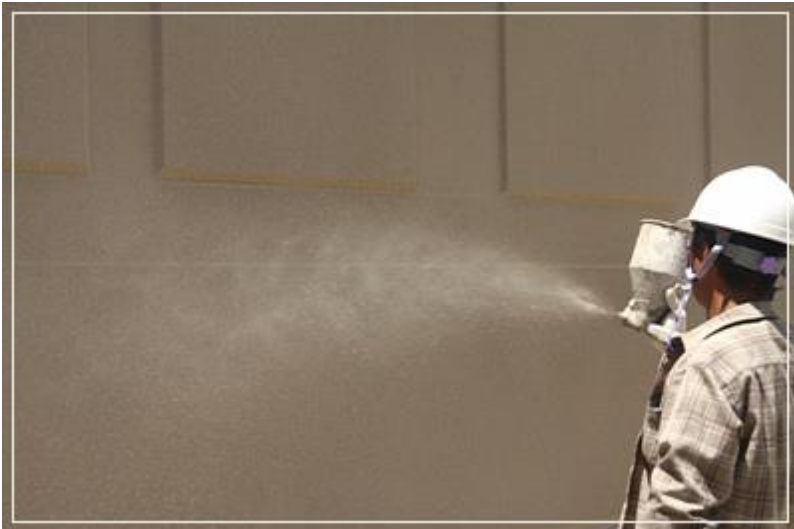
3. YEGREENA STONE EVER primer/intermediate coating