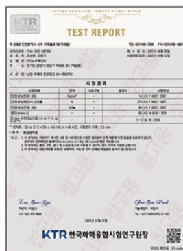
Physical property report